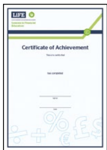
Blank milestone certificate